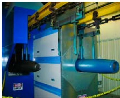
An infrared booster oven and convection oven combination cures the finish on these massive missiles.

In a straight cost comparison, the propylene glycol-based compound costs more than a conventional