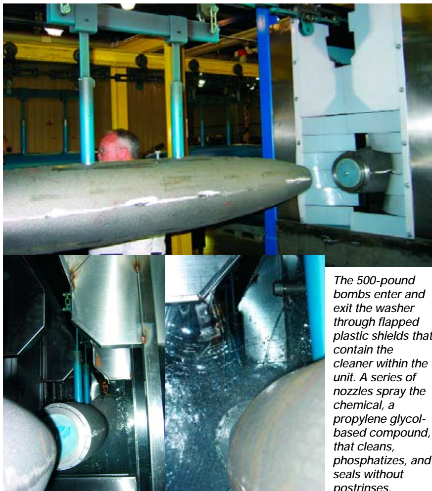
The 500-pound bombs enter and exit the washer through flapped plastic shields that contain the cleaner within the unit. A series of nozzles spray the chemical, a propylene glycol-based compound, that cleans, phosphatizes, and seals without postrinses.

problematic in getting permits to apply it. "Up until this point, everybody's been using the solvent-based paints, which is very unfriendly environmentally," Rice said. "It needs a ton of permits. With powder coat-