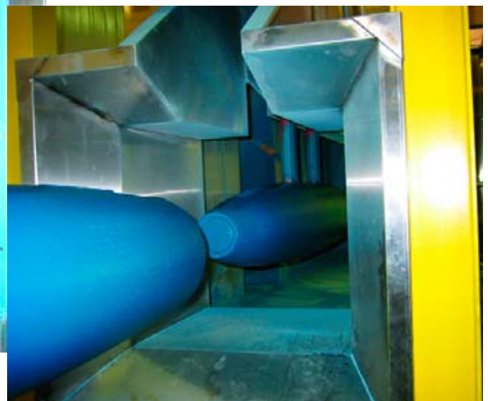
The finishing line powder coats the bombs with government-specified sky blue.