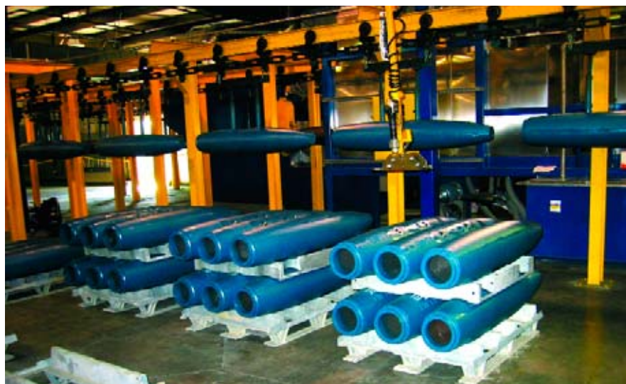
Allied Mechanical Wisconsin makes these practice bombs from cast-ductile iron. As a result they can be reused.

The combination of the one-step cleaner and powder allowed Allied Mechanical not only to meet, but also to surpass, the government's specifications for this project. In addition to assembling a finishing line that was environmentally compliant, the company was able to produce a more durable finish with powder than with the liquid coatings previously used. "There are a certain number of salt-spray hours to meet and everything else," Rice said. "What [the government is] finding with this powder is that it holds up so much better. The powder coating is performing very well for them—far superior to solvent-based." PC